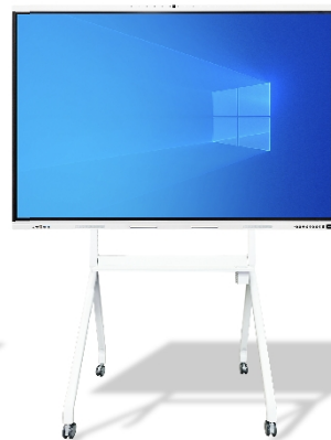
Pedestrian Stand Installation (Optional)