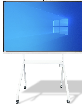
Pedestrian Stand Installation (Optional)