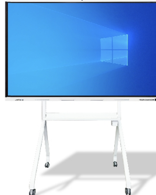
Pedestrian Stand Installation (Optional)