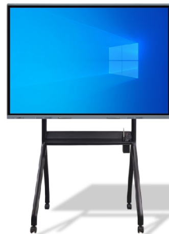
Pedestrian Stand Installation (Optional)