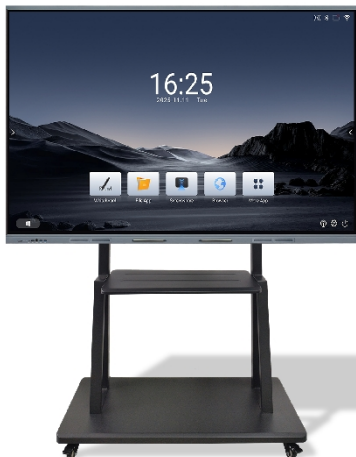
Mobile Stand Installation (Optional)