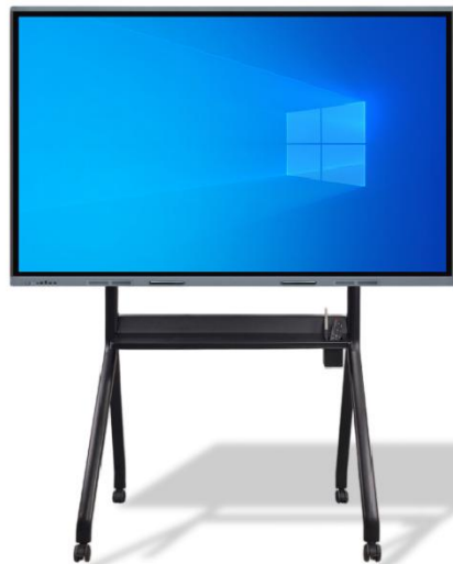
Pedestrian Stand Installation (Optional)