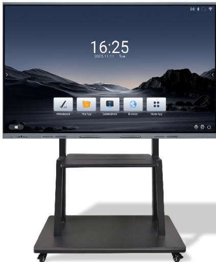
Mobile Stand Installation (Optional)