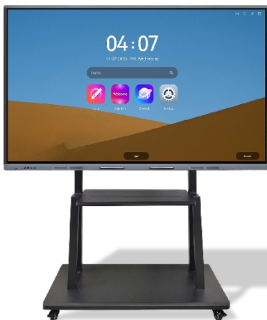
Mobile Stand Installation (Optional)