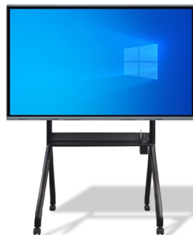
Pedestrian Stand Installation (Optional)